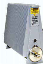
HIGH POWER LOADS